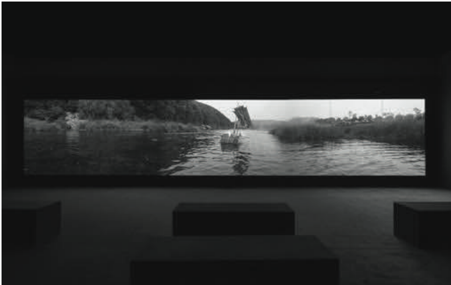
above and facing page Citizen's Forest (details), 2016, three-channel video, b/w, ambisonic 3D sound, 26 min 6 sec