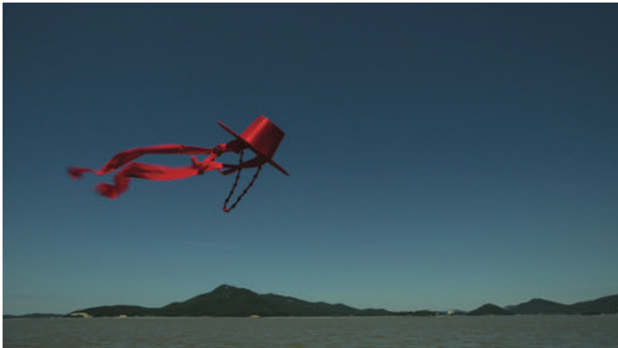
Manshin: Ten Thousand Spirits (still), 2014, HD video, 104 min