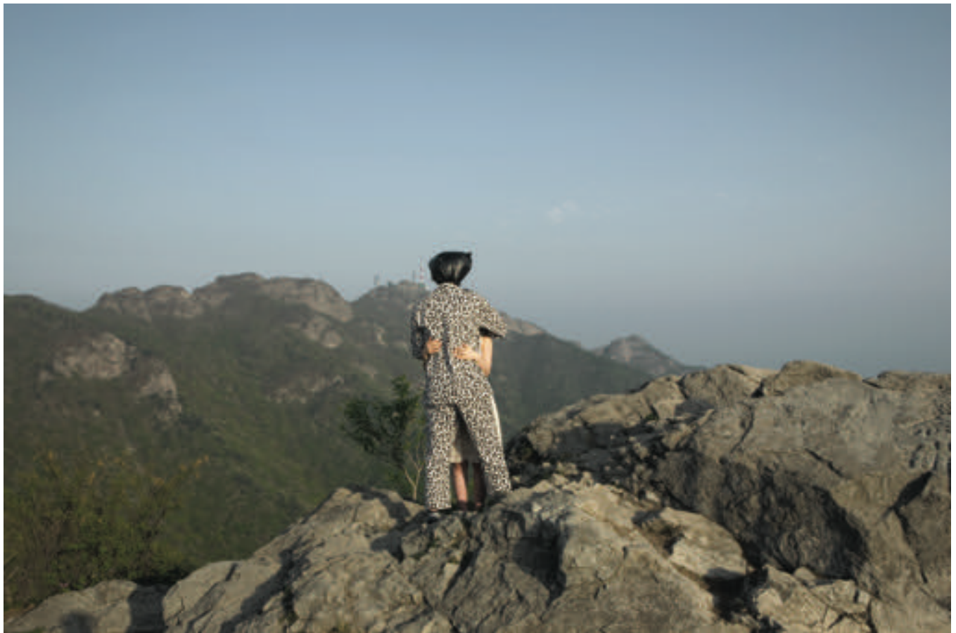
Sindoan (detail), 2008, mixed-media installation