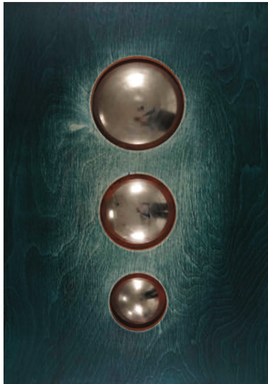
top Way to the Seung-ga Temple (detail), 2017, multichannel slide projection in loop and installation, dimensions variable